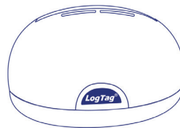
LTI-HID Not Included